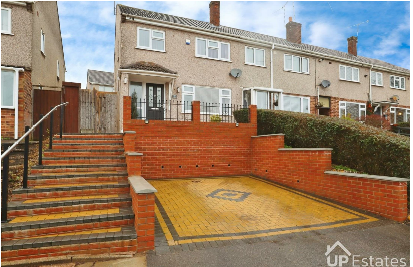
Chenies Close, Coventry